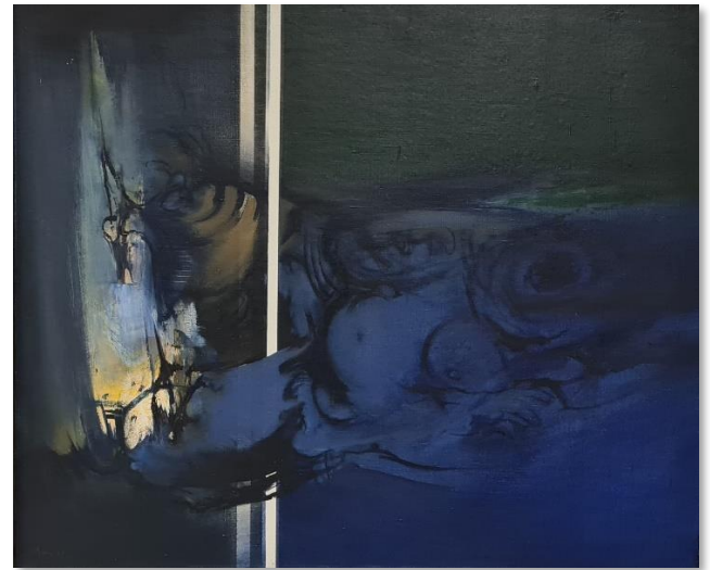
Wim Blom, 1927–2021

Drive-in series XVII, 1981, pastel on paper