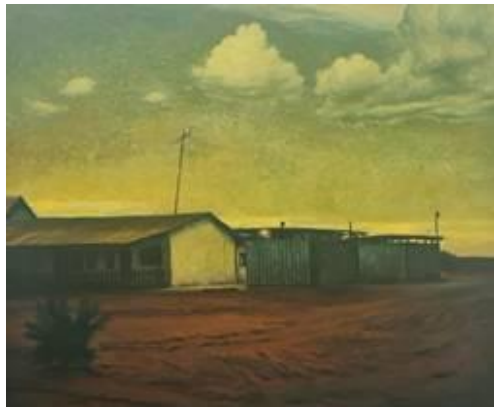
Walter Meyer, TV room, bar and showers , oil on canvas