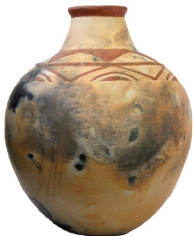
Angerina Simushi, Pit fired clay pot , earthenware