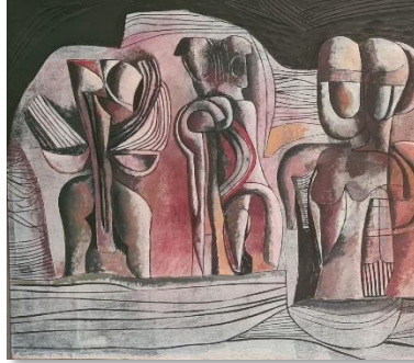
Cecil Skotnes, Figures in a metaphysical Landscape #6 , 1989, painted engraved wood