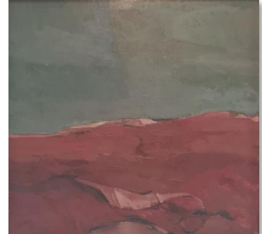
Cecil Skotnes, Red Landscape , oil on board

In 1952, Cecil Skotnes became synonymous with Polly Street. It was he who guided the Polly Street Art Centre to the level of creative innovation that gave it a unique position in the history of South African art. He set out to promote an indigenous African idiom among his art students. He carried out significant public commissions, sometimes in collaboration with other major artists, such as Sydney Kumalo. Skotnes is remembered for his artistic innovation and major contribution to the diversity of South African art.