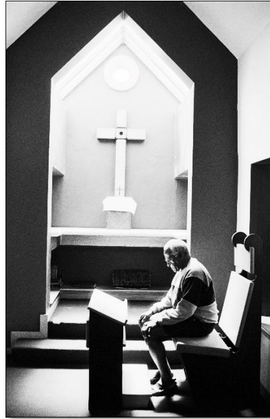
Anglican Archbishop Emeritus Desmond Tutu observing a moment of reflection inside his family's private chapel in Orlando West, Soweto