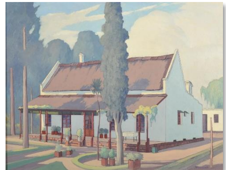
Hendrik Pierneef Huis, Prinsloo- en Strubenstraat 1946, oil on board

Over the centuries the house and home has appeared in the fine arts, literature and music. There is no place like home and there is something special about this place where the heart is; the space that gives us shelter and that we use as a residence.