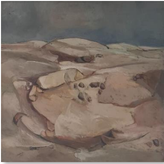
Cecil Skotnes, Landscape , 1955, oil on canvas