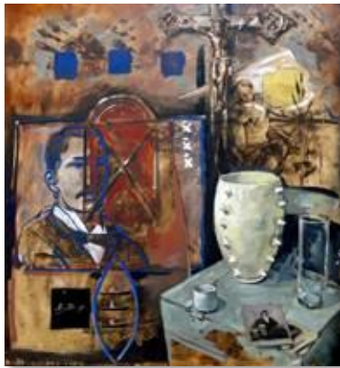
Rudolph Vosser, Untitled , oil on hardboard