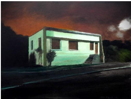
Clare Menck Cottage in Parisian Suburbia , 2014, oil on canvas