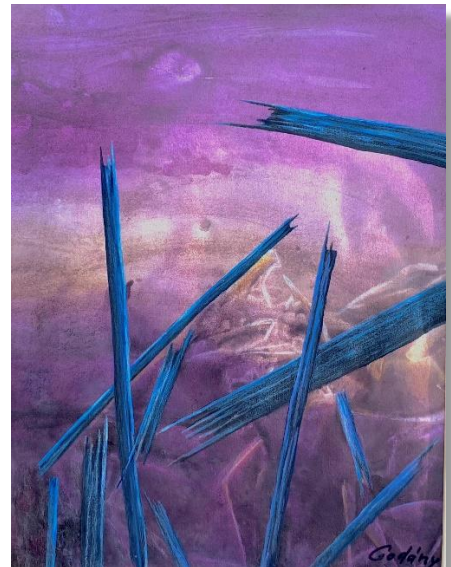
Alexander Godány, Without notes series , 2005, mixed media on paper

The exhibition by the Slovak artist, Alexander Godány, is hosted by the Pretoria Art Museum and the Embassy of the Slovak Republic in Pretoria until 18 June 2023. The exhibition is the first of a series of cultural events which the Embassy of Slovakia would like to realise in South Africa in years to come with the aim of deepening friendly relations between the two countries and nations.