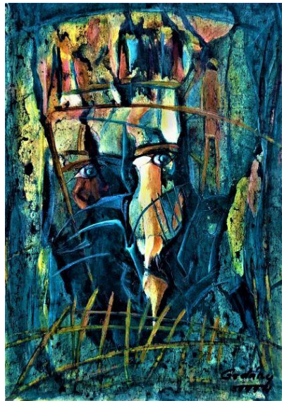
Alexander Godány, Prophet , 1994, mixed media on paper