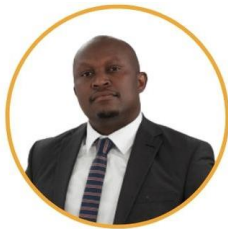
Tshifhiwa Tshivhengwa CEO of Tourism Business Council of South Africa